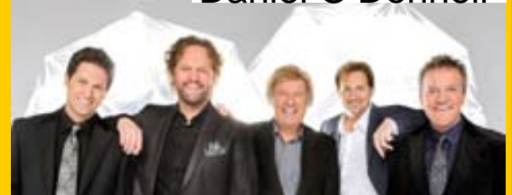
Gaither Vocal Band

Once in Minot, you'll have two full days at the Norsk Hostfest— North America's largest Scandinavian Festival. You'll experience contemporary and traditional elements of the Scandinavian culture through all your senses.